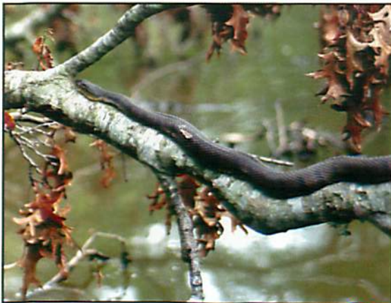
Northern water snake in Wilderness Area