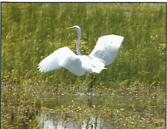
Great egret on Rockhouse Cypress Marsh