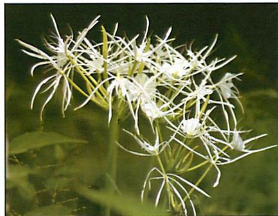
Spider lily along Mingo River