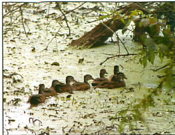
Wood duck brood on Red Mill Pond