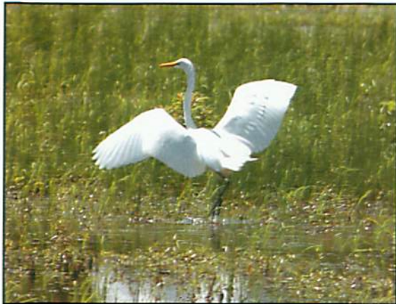
Great egret on Rockhouse Cypress Marsh