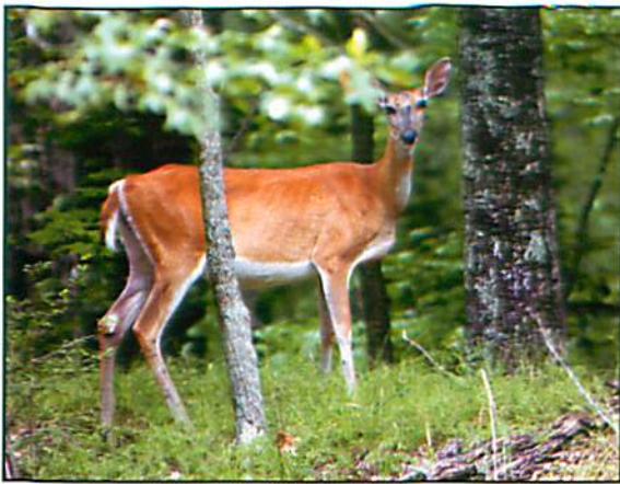
White-tailed deer on Bluff Road